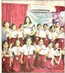
টিকা নেওয়ার পরে পদযাত্রা — এই সময়